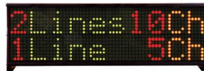
TRI color Outdoor